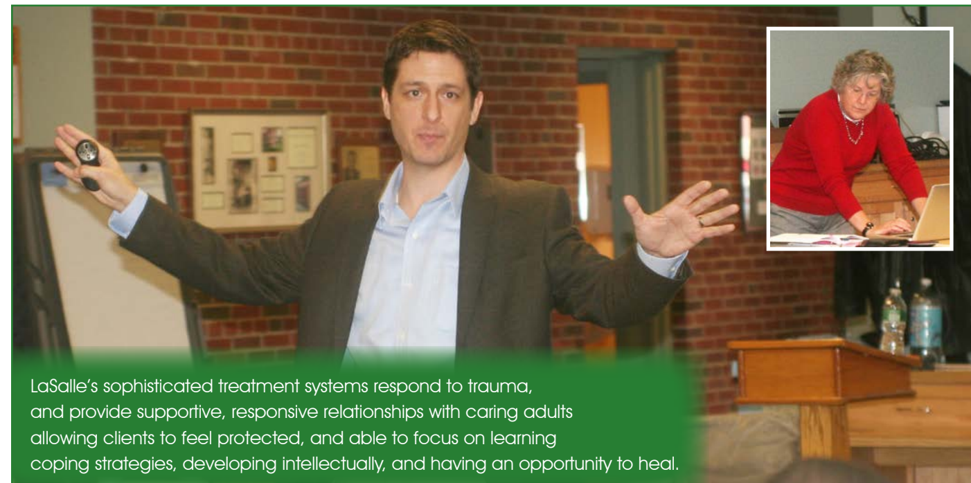
LaSalle's sophisticated treatment systems respond to trauma, and provide supportive, responsive relationships with caring adults allowing clients to feel protected, and able to focus on learning coping strategies, developing intellectually, and having an opportunity to heal.

In June 2013, all thirteen students in LaSalle's senior class received New York State diplomas, eleven with NYS Regent's diplomas. One young man was the first of nine siblings to graduate from high school. The Troy Record newspapers featured the LaSalle graduation on the cover of the next morning's edition.