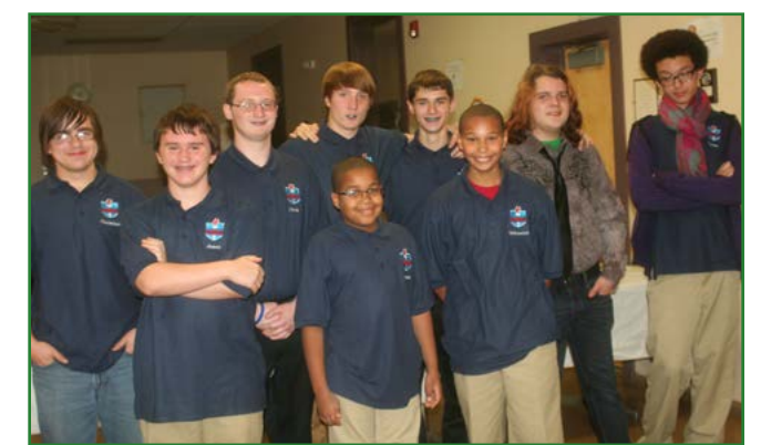
Student Senate officers for the 2013-2014 school year were inducted in October after a special dinner for senators and their families held at LaSalle School.