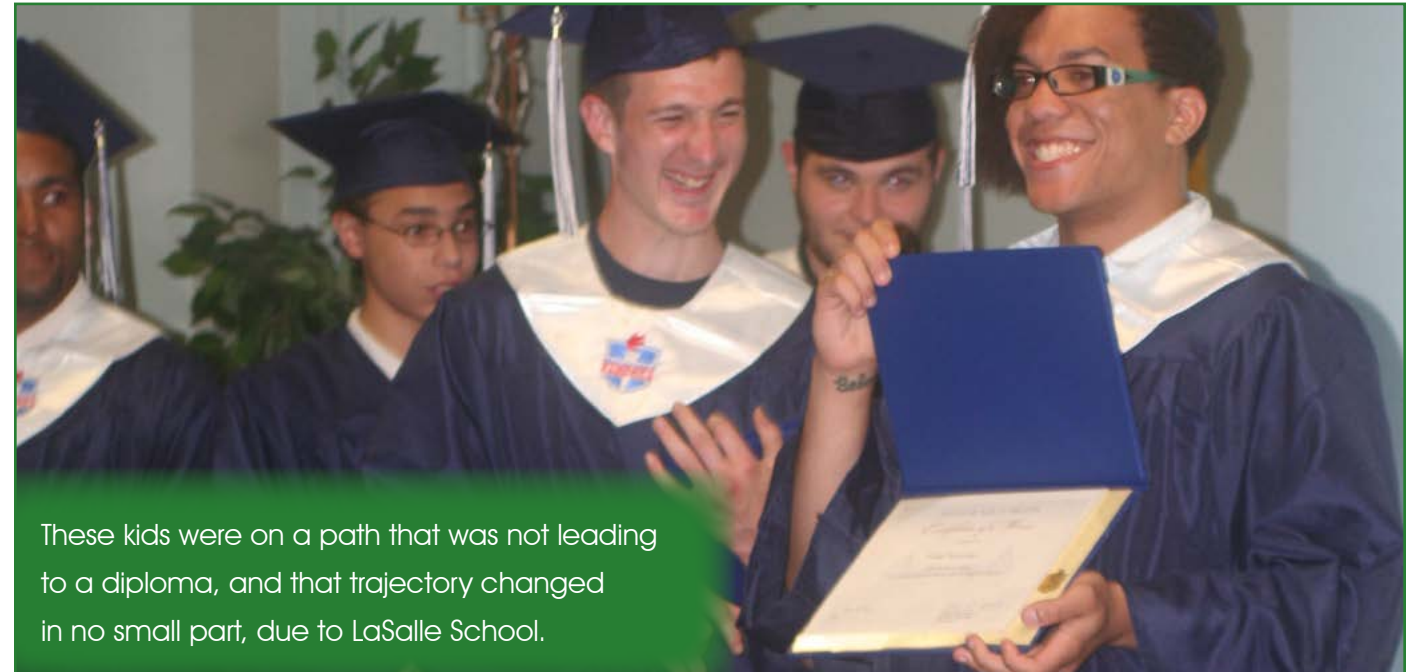
These kids were on a path that was not leading to a diploma, and that trajectory changed in no small part, due to LaSalle School.